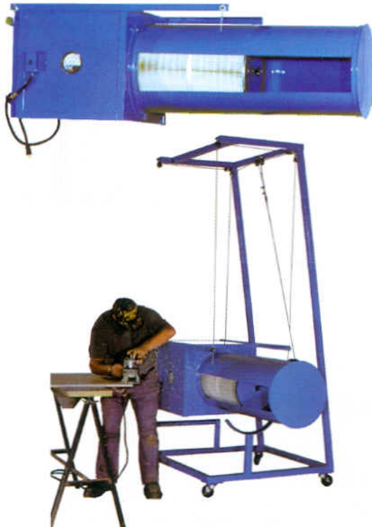
Standard features: Maghelic gauge; on-off switch; 115 - volt; 1 1/2 HP 3000 CFM