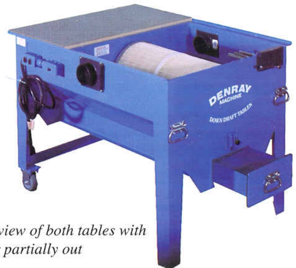
Inside view of both tables with drawer partially out