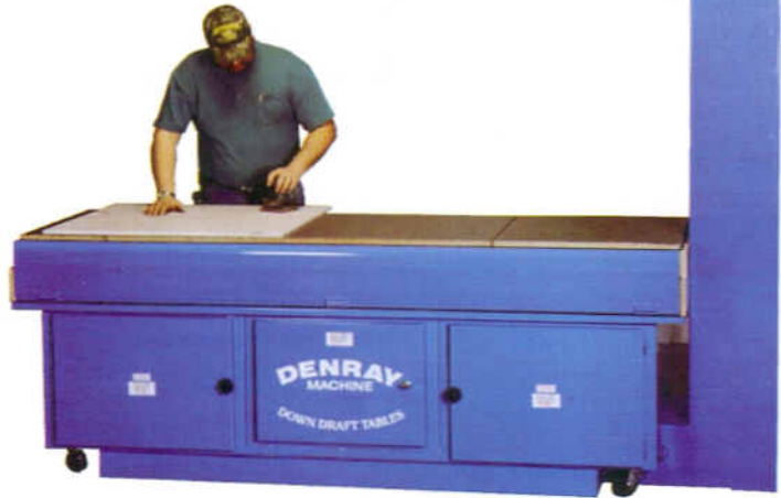
3696SS shown with optional chimney

The standard features of this table may be read on the 4896 LP page: from the top down this is the same as the 4896LP.