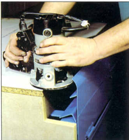
Chip deflector in up position for use with router