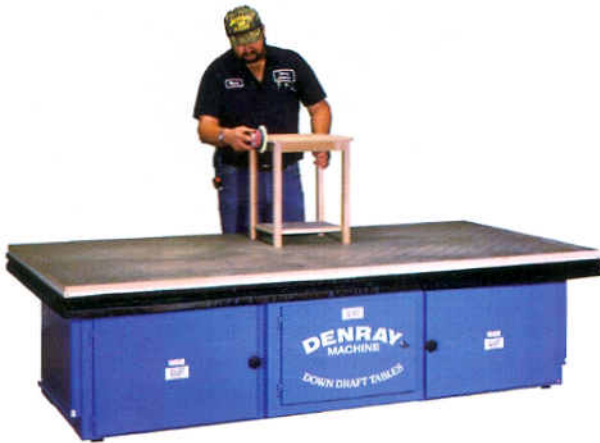
Top in down position to sand larger items

Size 48" x 96"; Height 26" - 38"; weight 1000 lbs.; Motor 5-HP - 3PH; Voltage 230-460-575; sound level 82 decibels; 4800 CFM after the filters