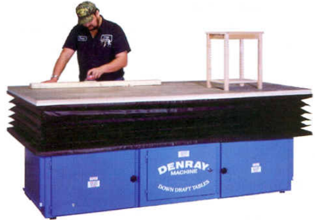
Top in up position to sand flat goods