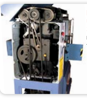
POWERFUL MOTOR AND OIL GEARBOX WITH 3 SPEEDS keeps the machine purring like a tiger.