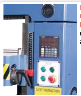
DIGITAL THICKNESS CONTROL AND EASY BED ROLLER ADJUSTMENT make for quick adjustments and setup.

Our customers can't say enough good things about the 4470. Quality, value, precision, ease of use, the list goes on and on. Below are just a few examples.